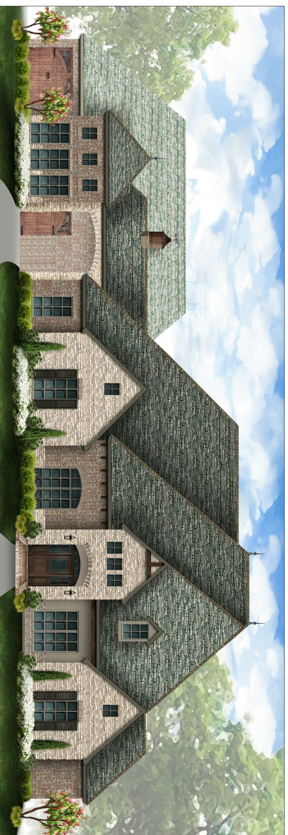
CONCEPT RENDERING **NOT TO BE USED FOR CONSTRUCTION**

To the best of my knowledge these plans were and are original designs and thoughts of the homeowner or contractor, and are the copyright of that particular individual. This company shall not be held responsible for any copyright infringement. Furthermore, these plans are drawn to comply with owner's and/or builder's specifications and any changes made to them are the responsibility of the owner's and/or builder's expense. The contractor(s) shall verify all dimensions of enclosed drawings. Rapid Home Designs LLC, is not liable for errors once construction has begun. While every effort has been made in preparation of this plan to avoid mistakes, the maker can not guarantee against human error. The contractor(s) of this job must check all dimensions and other details prior to construction and be solely responsible therefor.